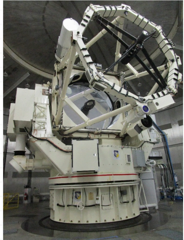
The 3.6-meter, 75-ton Advanced Electro-Optical System (AEOS) telescope shown above is the largest optical telescope in the Department of Defense. In addition the Maui Space Surveillance System facility houses several other telescopes ranging from 0.4 to 1.6-meters.

Since 1980, numerous studies have been undertaken at Haleakala Observatories in the interest of environmental, cultural, historic, and economic resources, as well as to mitigate the potential impacts to those resources. AMOS observes environmental conservation programs that include protection of the silversword plant and the Hawaiian Nene, or Goose, which are on the Federal List of Endangered Species and can be found atop Haleakala.