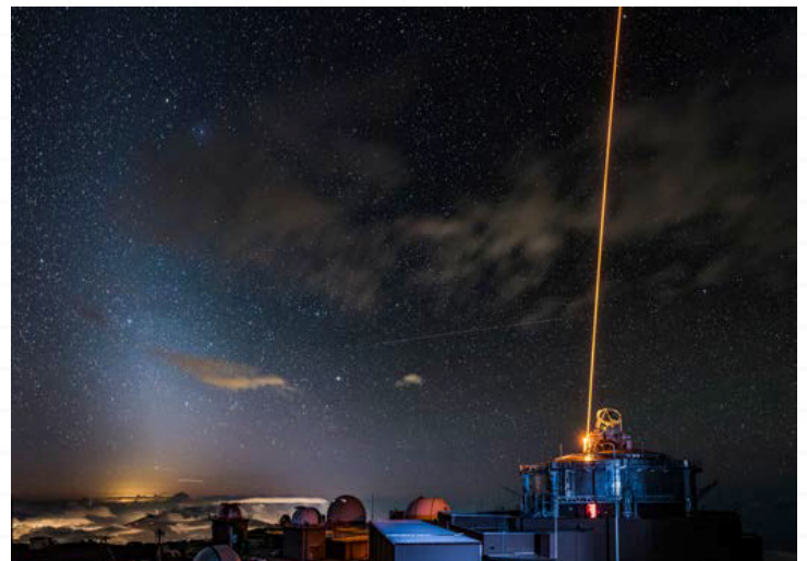
Sodium guidestar for sensing atmosphere at the Maui Space Surveillance System facility atop Haleakala.

The unique focus on research and development as well as operations provides a rapid development cycle from concept to operational implementation. Researchers are exposed to the actual needs of the operational space community and are able to provide innovative answers in an operationally relevant time frame.