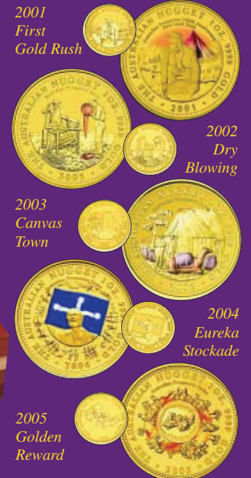
2001 First Gold Rush 2002 Dry Blowing 2003 Canvas Town 2004 Eureka Stockade 2005 Golden Reward