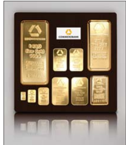
Commerzbank bars are sold to dealers and fabricators around the world.