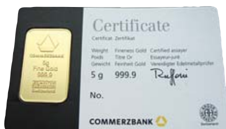
Minted bars are packaged in sealed cards.

Commerzbank AG Luxembourg Branch had previously operated, until 2010, as part of Commerzbank International SA, which had been established in Luxembourg in 1969.