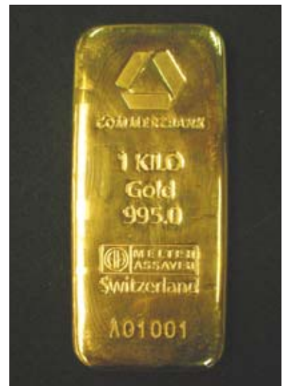
Commerzbank bars were rebranded with the new Commerzbank logo in January 2010.