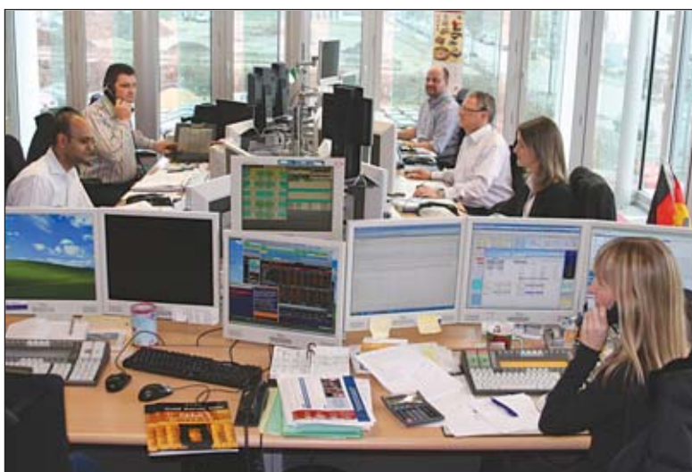
The Global Precious Metals desk of Commerzbank AG Luxembourg Branch.