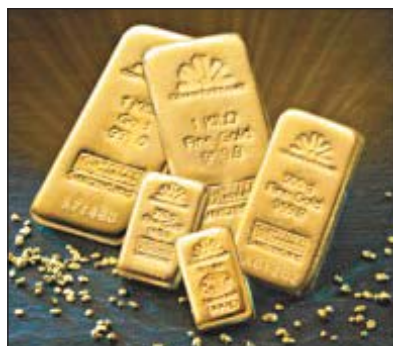
Illustrating the former Commerzbank logo that was applied to cast and minted bars between 1999 and 2009.