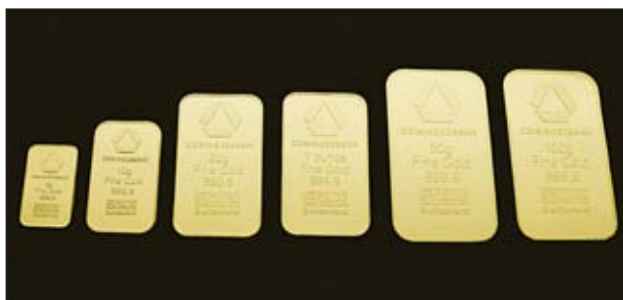
Commerzbank bars are issued in gram, ounce, tola and tael weights for the international market.

* In current dimensions.